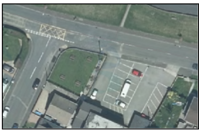
Aerial Image 2020