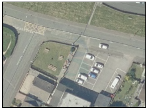
Aerial Image 2017

Having undertaken a review of aerial imagery it is clear that the area of land circled in red above has been continuously used as a beer garden since 2001. Since 2017, the aerial imagery and street view evidence suggests that the whole area of land has been used as a beer garden in connection with Pencoed Social Club (British Legion), as shown below: