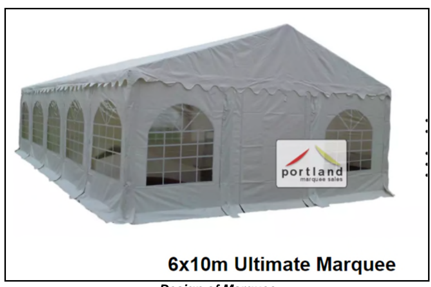
Design of Marquee

Full planning permission is sought for the erection of a marquee in association with Pencoed Social Club (British Legion) at 37 Hendre Road, Pencoed. The marquee is proposed to measure 6 metres in width and 10 metres in depth, reaching a maximum height of 3.3 metres with a 2.3 metre high eaves height. It will have a galvanised framework with extra heavy duty PVC covers in a white colour, as shown below: