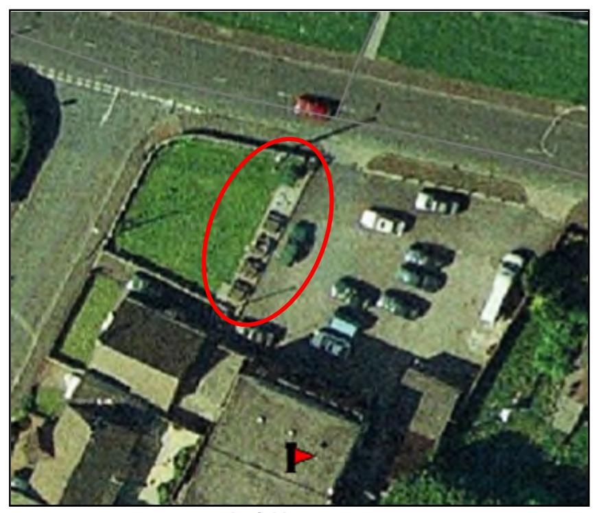
Aerial Image 2001

The area of land to the north of the dwelling has been partially used in connection with club since at least 2001, as shown circled in red on the aerial image below: