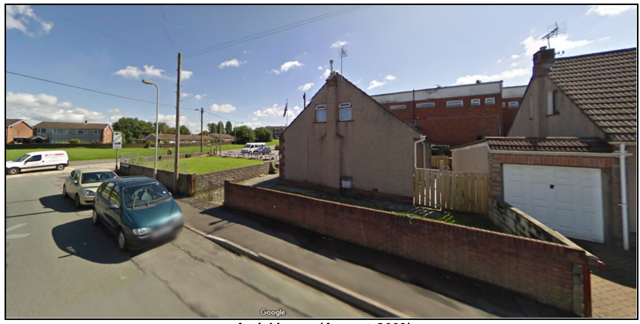
Aerial Image (August, 2009)

From reviewing street view images, it is clear that the plot associated with the dwelling at 1 Woodland Avenue has been physically sub-divided by a brick wall since at least August 2009, as shown below: