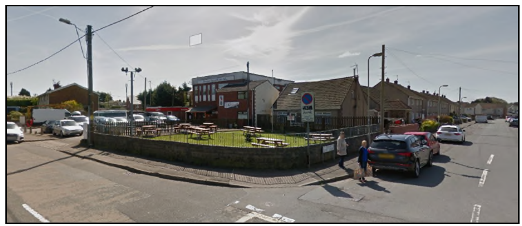
Google Image Street View (April, 2017)