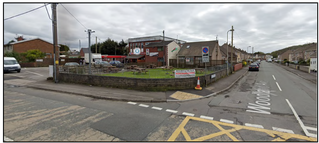
Google Image Street View (May, 2018)

In consideration of the above, the Authority cannot reasonably accept that the whole area of land has been used as a beer garden in connection with Pencoed Social Club (British Legion) for a period in excess of 10 years and therefore the use of the land is not formalised. As such, this Planning application will consider the acceptability of the use of the land to the north of the dwelling known as 1 Woodland Avenue as a beer garden used in connection with Pencoed Social Club (British Legion) and the erection of a marquee.