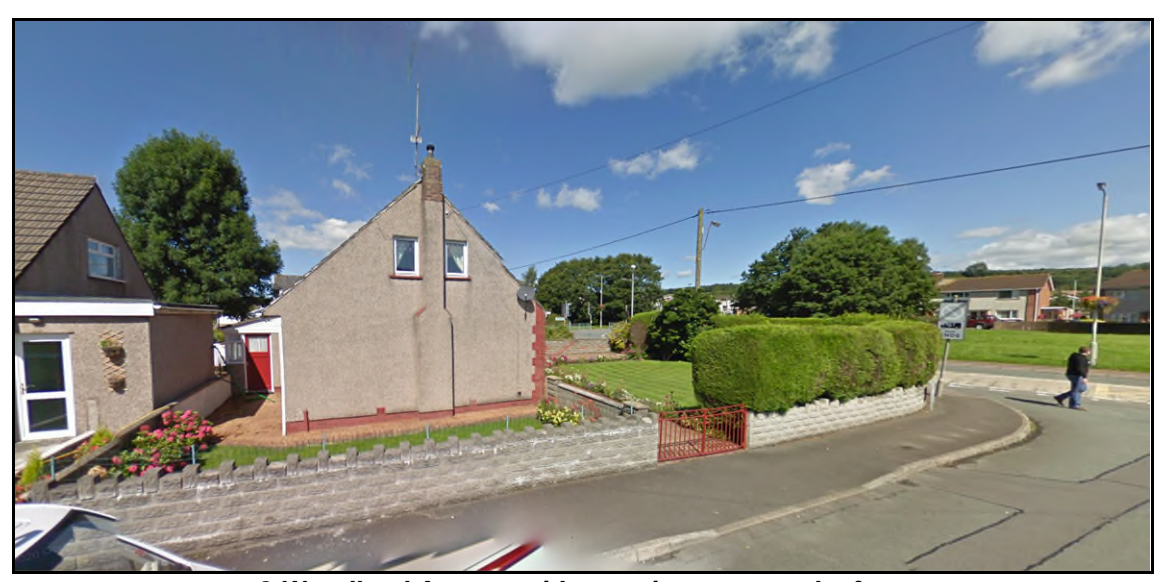
2 Woodland Avenue with amenity space to the front

Prior to the occupation of the land to the north of the dwelling as a beer garden, the property would have been located within the southern area of a corner plot between Hendre Road and Woodland Avenue, and would have benefitted from a relatively large amenity space to the front of the dwelling, similar to the dwelling known as 2 Woodland Avenue which is located on the opposite corner plot, as shown below: